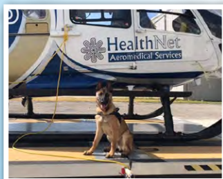
Our Base 5 mechanic's pup, Yasha, posed in front of the aircraft to celebrate turning 5 months old.