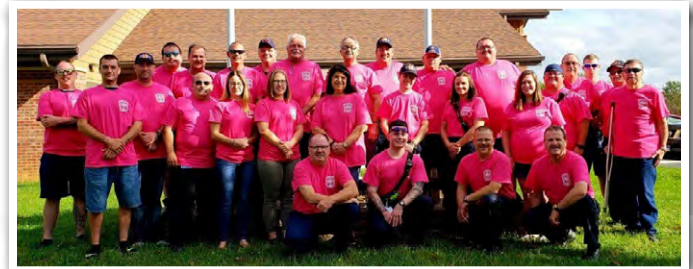
Jefferson County Emergency Services Agency team members.

As a West Virginia Office of EMS accredited Training Institute, JCESA offers more than 80 training and continuing education opportunities each year. Free first aid and CPR courses are also available to the community.