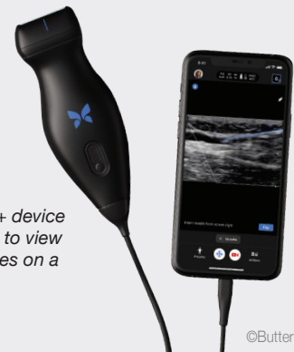
The Butterfly iQ+ device allows clinicians to view ultrasound images on a mobile device.

The use of this new tool will be closely guided by the program's Medical Director and Education Department to ensure proper use of the devices and to monitor diagnosis practices.