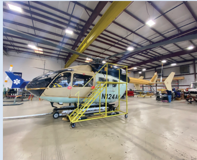
The EC145e aircraft awaits exterior and interior modifications by the Metro Aviation team in Shreveport, Louisiana.